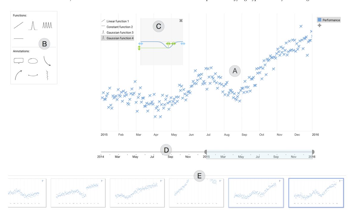
Figure 1: The SelfRaisingData prototype with the main components highlighted. (A) The time series chart with the fictional data points generated around the shape described through function composition, as presented in Section 4.1. (B) The tool panel containing functions and annotations (Section 4.2). (C) The function editor allows interactive modification of the mathematical parameters of the function and the time range for which it applies, as discussed in Section 4.3. (D) The time axis range selector (see Section 4.4). (E) Graphical history using a comic strip metaphor allows branching and visualising previous states (see Section 4.5).